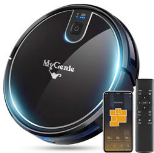
MyGenie X Sonic Wifi Pro Robotic Vacuum Cleaner Carpet Wet Dry Mopping Black