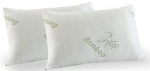
Royal Comfort Luxury Bamboo Covered Memory Foam Pillow Twin Pack Hypoallergenic