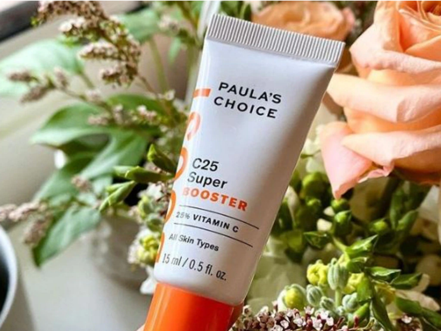
Beloved beauty brand, Paula's Choice, is offering 15 per cent off first orders from newsletter subscribers.

Save 15 per cent off your first order when you sign up for emails