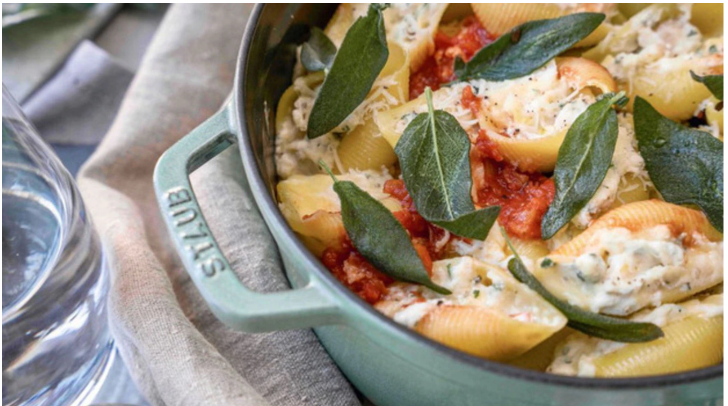
Staub cookware is now discounted at Myer.

Save across all categories for the Super Weekend Sale