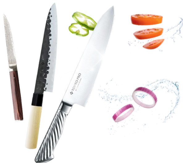
House of Knives

House of Knives is an Australian retailer that offers the best-handpicked quality kitchenware whilst remaining affordable.